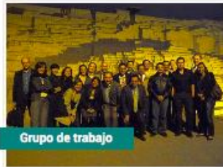
Grupo de trabajo